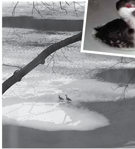
Above: Two Canada Geese that did not fly south for the winter walk on an icy pond. Top: This Horned Grebe came to the Center in February after being found grounded in a parking lot. After a few days of food and treatment for scrapes on its feet it was released to continue migration.

with help. You see this most often with waterfowl, such as Canada Geese and Mallards, in our ponds and lakes year round, even though our winters are harsh enough that many of our ponds will freeze over. Most waterfowl should migrate to southern states where the ponds are open in the winter and allow them access to food and protection from predators. It's important to keep in mind that as harmless as feeding geese and ducks may seem, this may ultimately lead them to stay in an area that is not suitable for them over the winter, and may cause more harm than good for that animal. If you've been feeding wild songbirds with a feeder in your backyard, you should keep in mind that birds will stay if there is enough food for